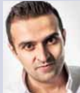
ASHISH THAKKAR CEO, Mara Group (Uganda)