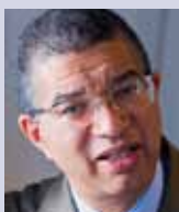
LIONEL ZINSOU President, PAI Partners (France)