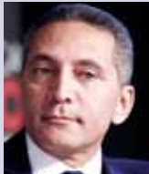
MOULAY HAFID ELALAMY Minister of Industry and Commerce (Morocco)